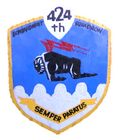
424 Bombardment Squadron

424 Bombardment Squadron emblem: A disc piped black, per fess debased engrailed, argent and azure, issuing from partition line a red sun rayed proper, surmounted by a black aerial bomb palewise, point to base. (Approved, 25 Feb 1943)